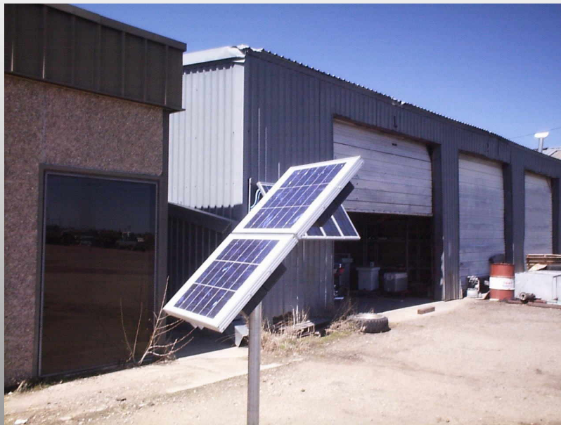
TOMCAT II-A with ADD-A-CAT II-A